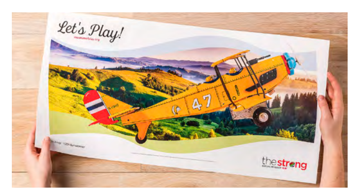
Extra-long sheet printing – maximum paper size 330 x 660 mm

It all adds up to better margins, higher profits and the ability to grow strategically with a single, future-proof investment.